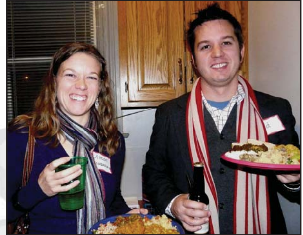
Holiday party – the best meal in town!