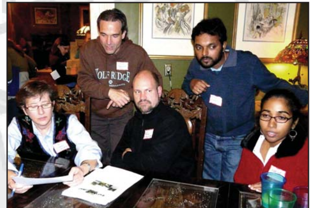
Geography Quiz Team at work