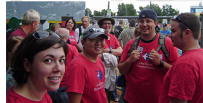
MNRPCV PC-50 T-shirts at the SaintPaul Saints game

Printed using windpower and non-toxic water based inks by a local printer, you can be sure that your purchase is a socially and environmentally conscious decision. Reserve your shirt now by emailing truong.tammy@gmail.com , or pick one up at the next MNRPCV Event. See the PayPal box at mnrpcv.org to buy your shirts online. These very special shirts sell for just $15.00 each ($18 with shipping/handling). Get yours now and a few extras for your family and friends.