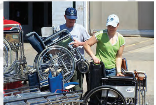
Loading wheel chairs