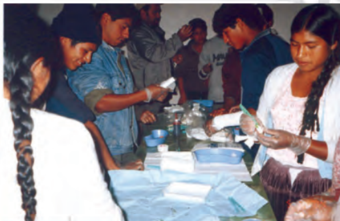
Bolivians unpacking supplies